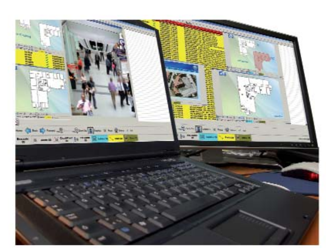
TXG: The Efficient way to control a Site Wide Emergency Management System

Tyco Expert Graphics is a fully featured emergency management system that has been specifically designed to present alarm information clearly and precisely, to speed up response times and ensure that the most appropriate response decisions are made.